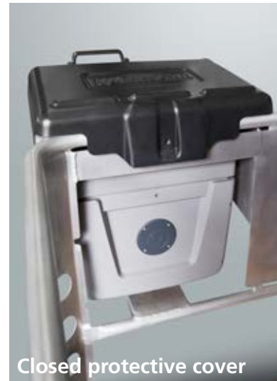
Closed protective cover

The RUTHMANN COCKPIT is insulated in accordance with the DIN VDE 0682-742 safety regulation (aerial devices for working on live parts with voltages up to AC 1000 V and DC 1500 V). The COCKPIT was designed and developed with customers in mind and is extremely user-friendly. All components are maintenance free and if required, can quickly be replaced individually without any degree of difficulty.